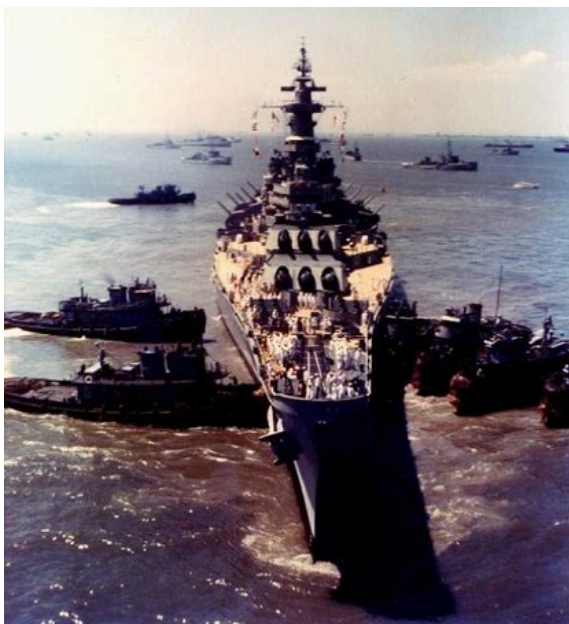
USS MISSOURI Grounding—January 1950