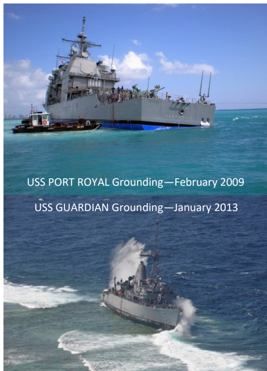
USS PORT ROYAL Grounding—February 2009